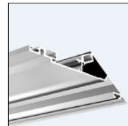
With opal cover